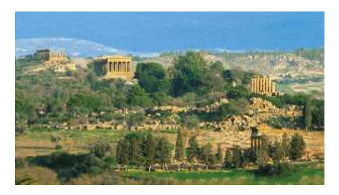
Fig. 1. Panoramic view of the Valley of the Temples in Agrigento, Sicily (Italy).

The historical site is visited each year by a number of guests variable between roughly 550,000 to 620,000 people between 2010 and 2015. Average monthly values are reported in Fig. 2, showing a variable number of visitors to the park during the year, with a peak in August.