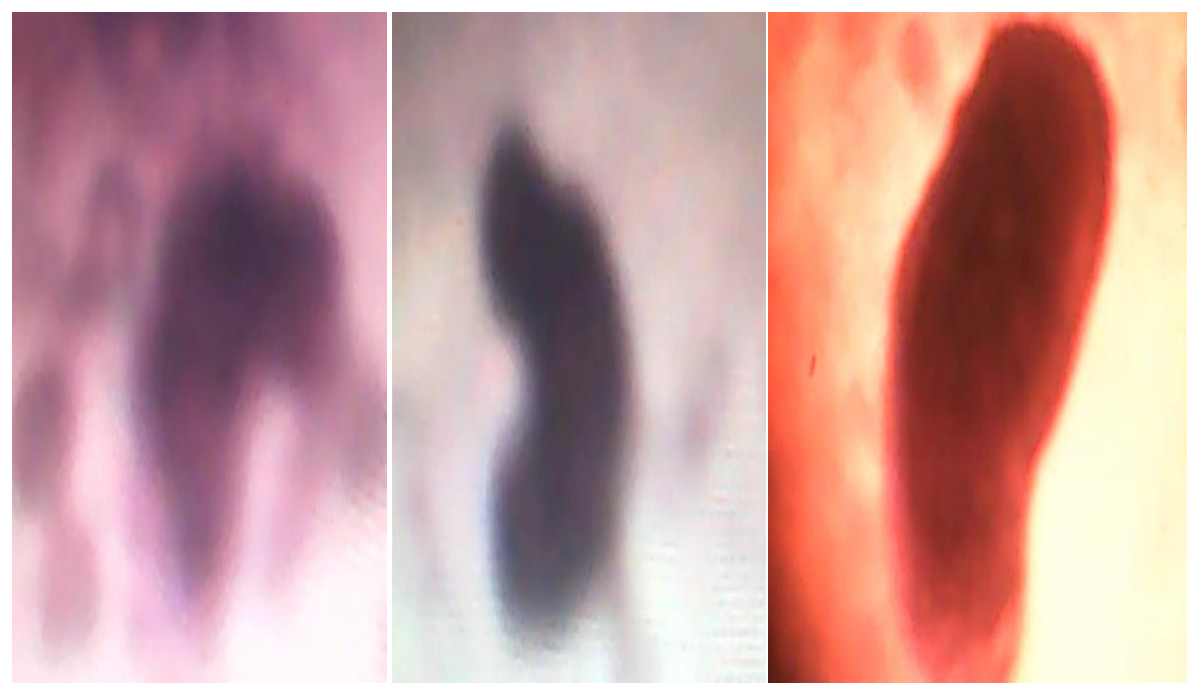
Plate III: Methanospirillum spp.