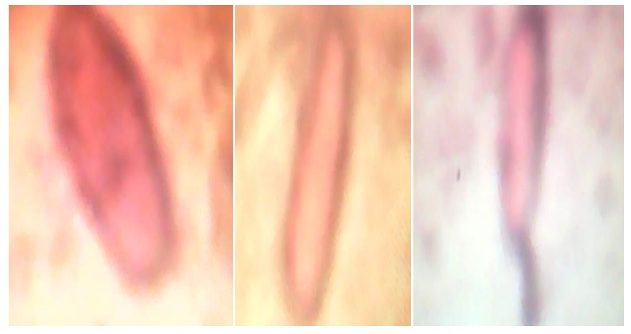
Plate II: Methanobacterium spp.