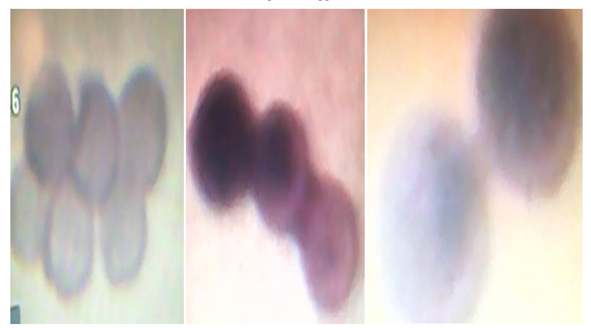
Plate IV: Methanococcus spp.