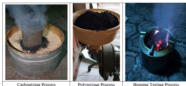
Fig. 2. The process of briquetting and testing.

Currently, the currency conversion unit of 1 US $ = IDR 14,000. Therefore, the "net worth" for the micro industry is equivalent to US $3.572 and the "annual sales result" equivalent to US $21.428. The average current selling price of corn briquette is IDR 6,000 or US $0.428/kg. Therefore, to reach the annual sales result of US $21.248, the necessary production of briquette is 50,000 kg/year.