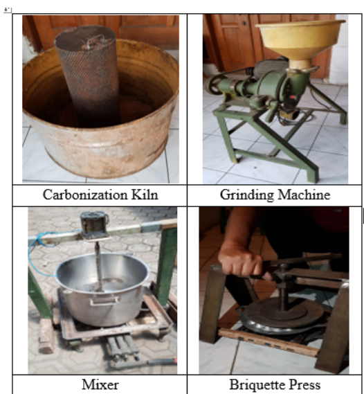
Fig. 1. The equipment used.

The equipment consists of Carbonization kiln, which is a simple drum with perforated fire tube in the center, Grinding machine, Mixer, and Briquette press machine, as shown in Figure 1.